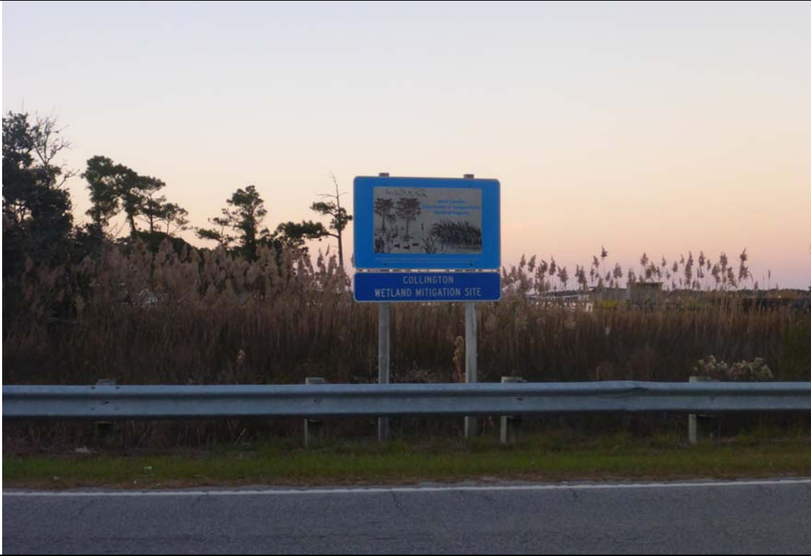
Photo 3 – NCDOT Mitigation Site signage visible from Colington Road with Colington site visible in background.