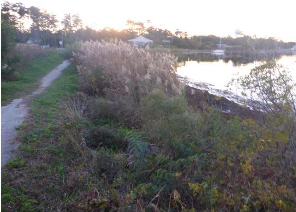
Photo 1 – Colington Cut mitigation site as seen from between the two mitigation areas facing west.