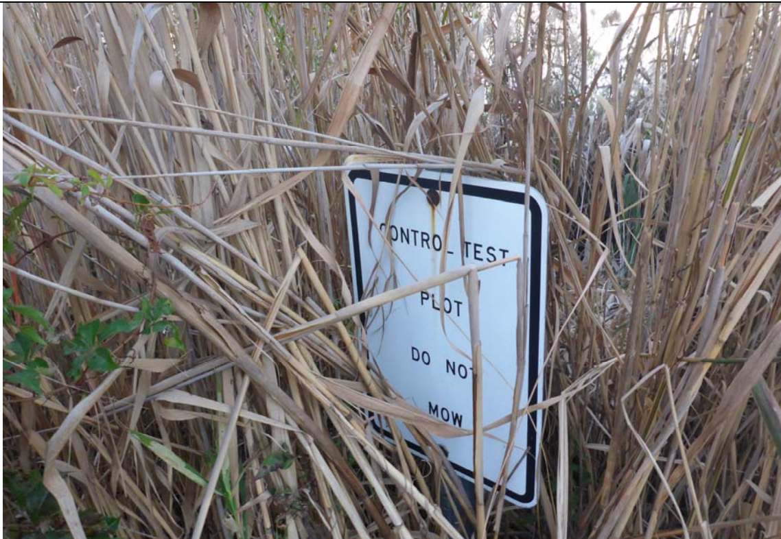
Photo 2 – Control Plot sign observed within the site (see attached Site Map for location).